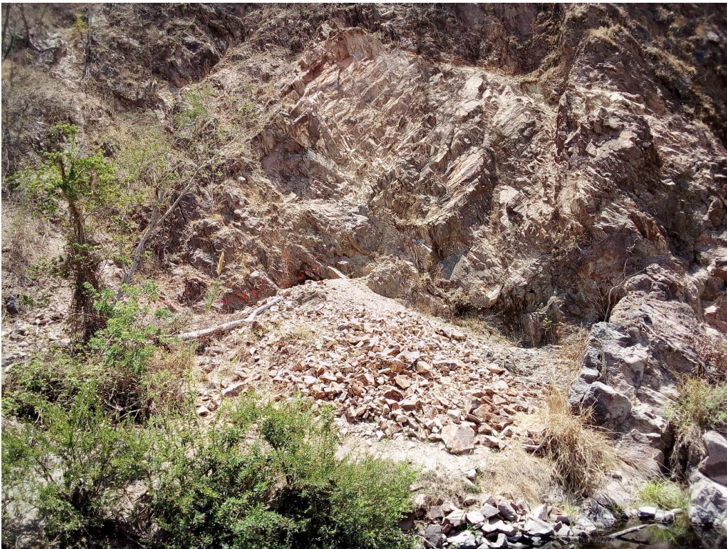
Photo 4. El Carrizo Zone showing with mine dump and barely visible covered entrance..