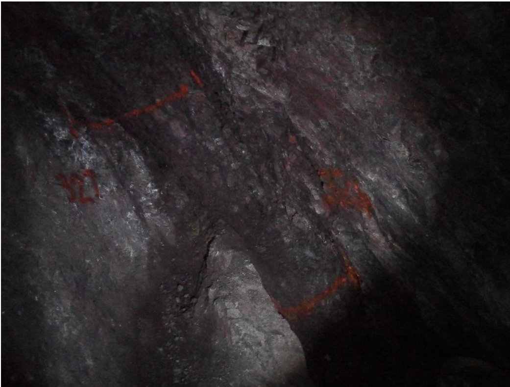
Photo 2. Los Gallos Zone underground sampling of vein face.