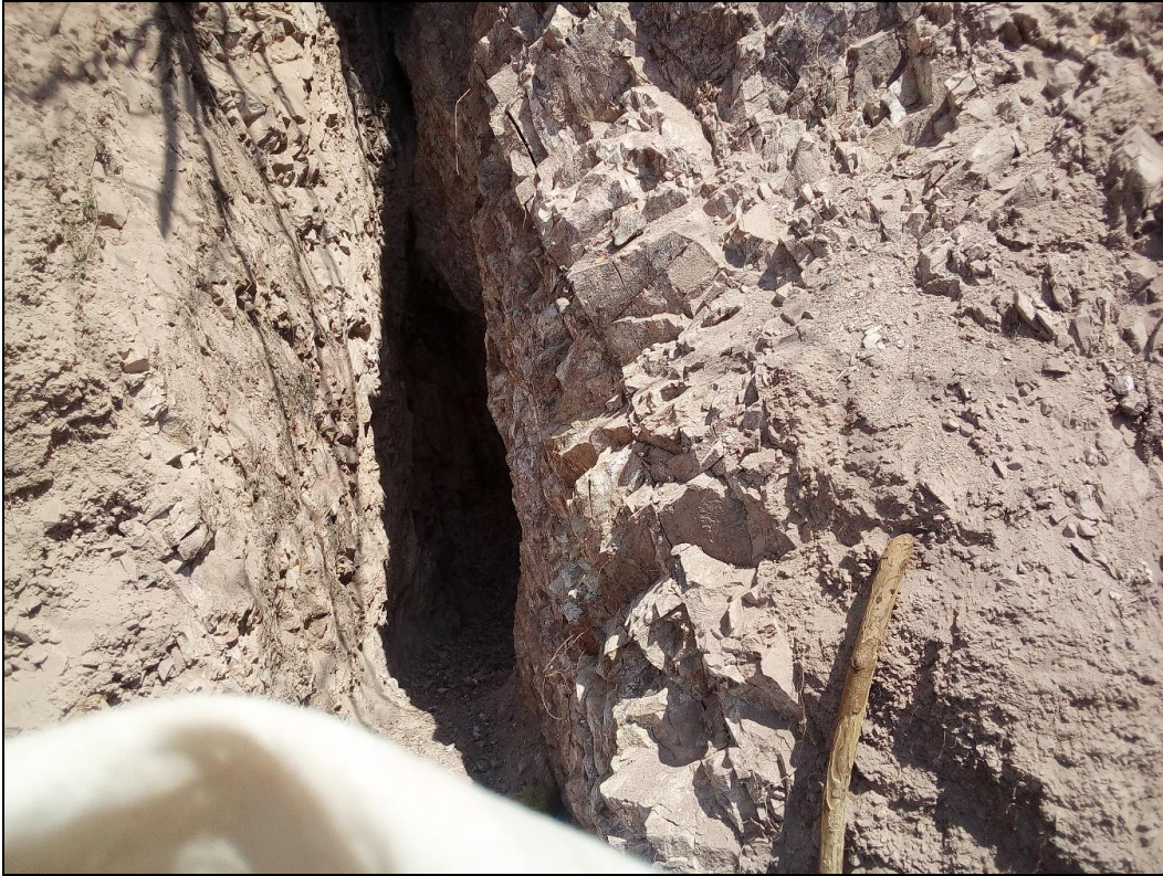
Photo 3. Las Palomas Zone with faulted vein structure.