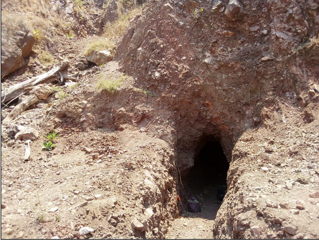
Photo 1. Los Gallos Zone underground entrance.